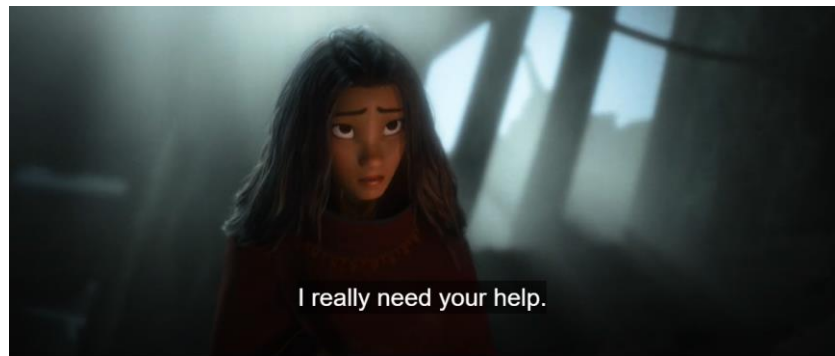
Figure 2. Raya Prayed to the Dragon to Help Her

The utterances of the type of directive could indicate that the speaker has intended meaning behind his/her words. In short, the speaker requests the listener what he/she needs to do. This type of utterance could be seen as follows.