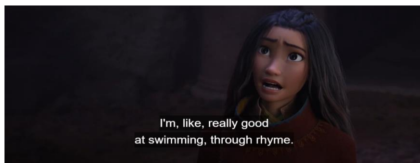
Figure 1. Sisu (the Dragon) Talked about Her Swimming Ability

According to Searle (1975), assertive is an illocutionary act conveyed to show facts, beliefs, and truths. The 11 assertive utterances employed by the characters in the movie portray the true or false dimension of what the characters believe about facts or truth. An example of assertive utterance was showed below.