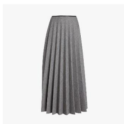
Figure 4. "Peter Do pleated cotton midskirt"

The writer tried to persuade the consumer to buy this product by sharing her feelings and experience in wearing the product and how her style looked in using the product. At the beginning of the advertisement, she included the word 'love' to emphasize her overall feeling towards the product.