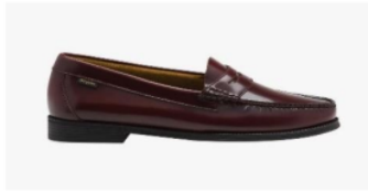
Figure 8. "G.H. Bass Whitney easy Weejuns"

This advertisement was classified into a mixed style. The first and second sentences of the advertisement were included in a soft-sell style since they expressed the writer's experience and feelings towards the products to touch the readers' feelings and attitude and persuade them to buy the product. The last sentence focused on describing the benefits of the products to the readers: the comfortable and stylish look of the product -- a hard sell. Thus, this advertisement was categorized as a mixed style.