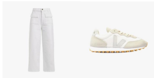
Figure 10. “Harrods Le Jean Leona wide-leg jeans” and “Veja Rio Branco leather-trimmed sneakers”