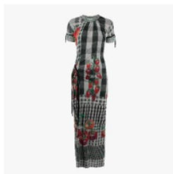
Figure 2. “Ottolinger tomato-print maxidress”