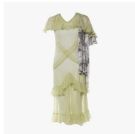
Figure 3. "Imitation of Christ scoop-neck midi-length dress"