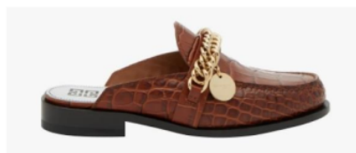
Figure 1. “Givenchy chain-embellished leather backless loafers”