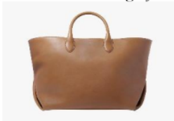
Figure 5. "Khaite Envelope Pleat medium leather tote"