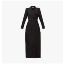
Figure 6. "Burberry Battersea garbandine trench coat"

This advertisement presented the product's benefit or feature in the last sentence, highlighting how this coat could perfectly hide her loungewear. This style directly emphasized the tangible features, facilities, and benefits. Moreover, she also included how she styled the coat.