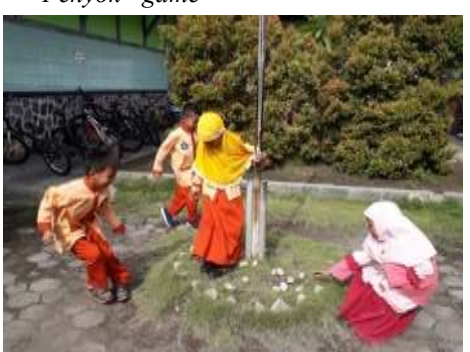
Fig. 1. Telor Penyok Game