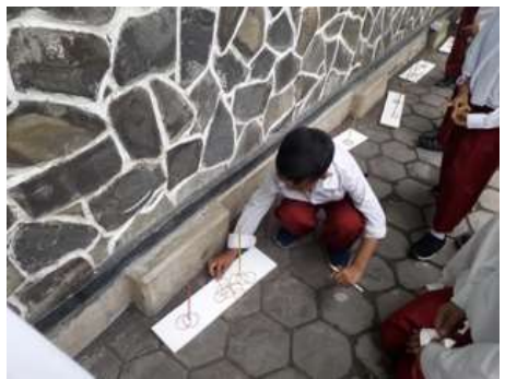
Fig. 2. "Koba Tiup" Game