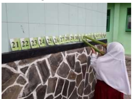
Fig. 4. Sret-sretan game