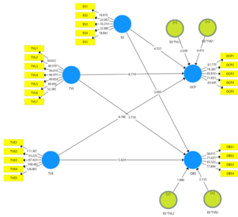
Figure 2 -- Structural Model