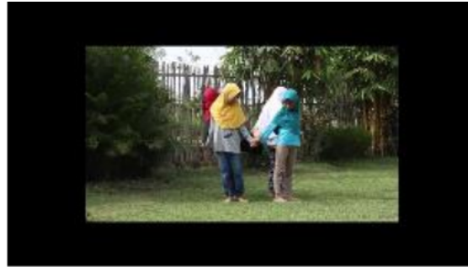
Figure 10. Children are playing dingklik oglak aglik in the garden

The cultural value of the traditional children's game 'dingklik oglak-aglik' is synergy and collaboration. These two values are realized in the process of synergizing the players' feet which are locked behind their bodies. The game is played by four people at the most. Thus, there are four legs being bent backwards and locked with each other's legs. The resilience to synergize and collaborate with each other is tested and trained by way of circling and tiptoeing. When the synergy and collaboration are not strong, the players will collapse on the ground shortly after they stand.