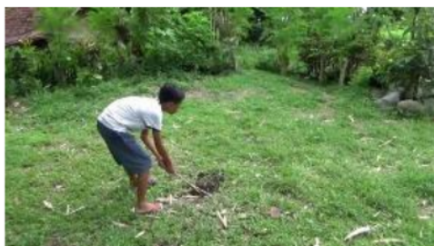
Figure 3. Children are trying to lever the stick in the bentik game