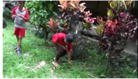
Figure 6. Children are playing kitiran umbul in the garden

The ' kitiran umbul ' game is played using hard leaves of a certain tree so that when it is tossed up, the leaves can reach a certain height and land in a zigzag movement like a windmill. When the dry leaf touches the ground, the players approach to see whether it lands upward or facedown to determine the winners and the losers. Some winners get another chance to fly up their leaves to determine a single winner. The cultural note contained in the game is the value of reality. From early age, children are faced with the reality of life. Life may bring luck or misfortune. However, joy and togetherness must be maintained in any situations.