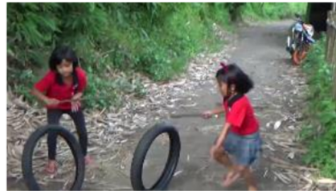
Figure 2. Children are playing rerodaan in the village street

The 'rerodaan' game is played by both boys and girls. The instrument to play the game is used car tires, bicycle wheel rim, or motorbike wheel rim. The tire or the rim is rolled around in a specific speed using a twig or a wooden stick to direct, adjust the speed, and to maintain balance. The player's fighting spirit and agility is tested as to how far each player can maintain balance and adjust direction and speed of the tire or rim precisely.