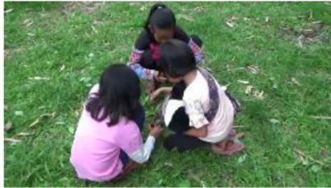
Figure 1. Children are playing dedek-dedekan in the garden

This game is commonly played by several girls in a rural area. Each of the players carry a doll as a baby she cares for. They play mothers or sisters of the baby by imitating the gestures of loving mothers and sisters such as patting, rocking, caressing, kissing, baby-talking, buying things, serenading, baby-feeding, putting them to sleep, etc. The role play is done to exercise their skills so they could give the same affection to their own children or siblings that God bestows on them.