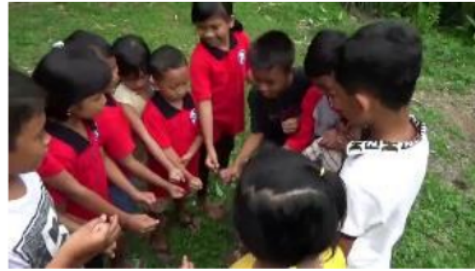
Figure 8. Children are playing a role as 'policemen' and 'thieves'

Playing roles in the traditional game ' polisi-polisian ' must involve several boys and girls. The game starts by determining the role of policemen / policewomen and the role of 'thieves'. The decision is made by counting and singing ' ling ling ling maling dan si si si polisi '. Then, they divide themselves into a 'policemen' group and a 'thieves' group. The policemen group discuss a strategy to catch the thieves, while the group of thieves finds the way to avoid being caught by the policemen. However, when the policemen could catch the thieves, discipline and obedience must be maintained.