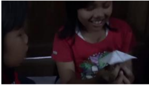
Figure 9. Children are playing mekrok using papers

Training children's intelligence is not merely done through formal learning at school, but it can also be done through playing with peers outside of classroom. By testing their intelligence using a trivia quiz game, the children are trained to be smart, capable, resilient, and knowledgeable individuals when they grow up [40]; [41]. In the traditional children's game 'mekrok', the intelligence test is done through a fun and exciting trivia quiz game.