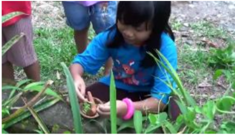
Figure 7. Children are playing a role as cooking housewives

The woman's gender role as housewives is to prepare meals for the family and the male gender role is to look for food and all other ingredients. This destiny is implanted among children since early age. Some families still maintain the roles. However, some families cannot maintain the gender-based labor division due to several conditions and reasons. Even though the development of times allows the destiny-based gender roles to be modified, in reality some gender roles are very essential and irreplaceable (Lieberman, 2009).