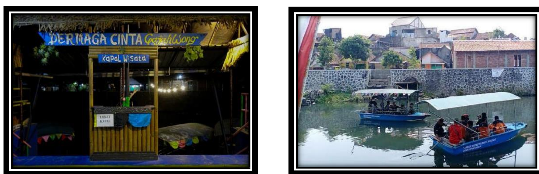
Figure 1. Dermaga Cinta in the Kali Gajah Wong Tourist Village

One of the tourist villages in Yogyakarta is the Kali Gajah Wong Tourism Village. This tourist village is in the Rukun Kampung Ponggalan area, Giwangan Kemantren Village, Umbulharjo District, Special Region of Yogyakarta. This area used to be a place for dumping rubbish and the river was dirty, but the local community, especially Karang Taruna, has the initiative to turn this area into an educational tourism destination that attracts tourists. Tourist destinations in the Kali Gajah Wong Tourism Village include Dermaga Cinta, Kelengkeng Village, and Bendhung Lepen. The tourist destination at Dermaga Cinta has water attractions that tourists can use to ride a boat using the flow of the Gajah Wong river, where tourists are charged IDR5,000.00 per person to enjoy these facilities. The name Dermaga Cinta has a philosophy so that people and tourists who visit the area will love the beauty and natural potential of the Gajah Wong River as shown in Figure 1 below.