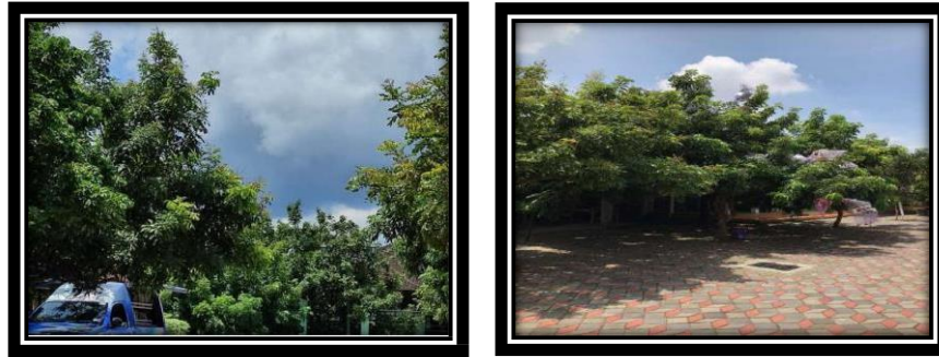
Figure 2. Kelengkeng Village in the Kali Gajah Wong Tourist Village (Source: Suwanto, 2023)