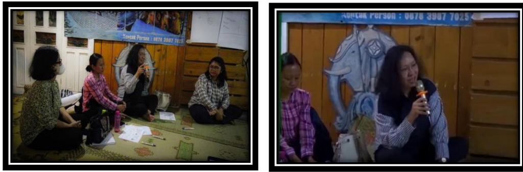
Figure 4. Literacy Assistance and Financial Inclusion in the Kali Gajah Wong Tourism Village

The next step in assistance that is carried out is to carry out an evaluation as shown in Figure 5 below, where the youth organization as a financial manager wants an application regarding financial management reporting that can be accessed by all parties, for example the local community, so that it will be more transparent in its financial reporting. Because of this, the service team provided suggestions, one of which was to use the Google Doc application and share the results of their financial reports via WhatsApp group media.