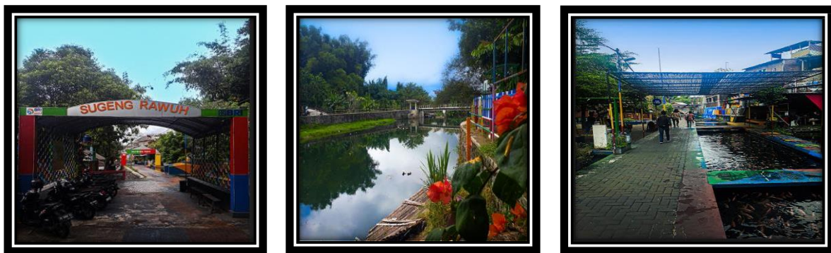
Figure 3. Bendhung Lepen in the Kali Gajah Wong Tourist Village

Tourist destinations in the Kali Gajah Wong Tourism Village attract tourists, where the number of tourists visiting this place is around 250 people/day from Monday to Friday and around 500 people/day from Saturday to Sunday (Suwanto, 2023). However, the natural potential and large number of tourists visiting this place do not necessarily provide economic benefits to the Kali Gajah Wong Tourism Village. This is because entry tickets to this tourist destination have not yet been implemented for tourists. The economic benefits of this tourist destination have only been felt by traders who sell their goods in this place. The income obtained by the Kali Gajah Wong Tourism Village is only obtained from vehicle parking, but there is no policy regarding parking fees until now so that tourists can pay parking fees as willingly as possible. The income obtained by the Kali Gajah Wong Tourism Village is also obtained from daily levies paid by traders who sell their wares in this place amounting to IDR 2,000.00/day and the proceeds from selling some of the fish that have been harvested once every 4 months. The fish that have been harvested from the Bendhung Lepen tourist destination will be consumed by the local community and will be sold to the public if there is any left.