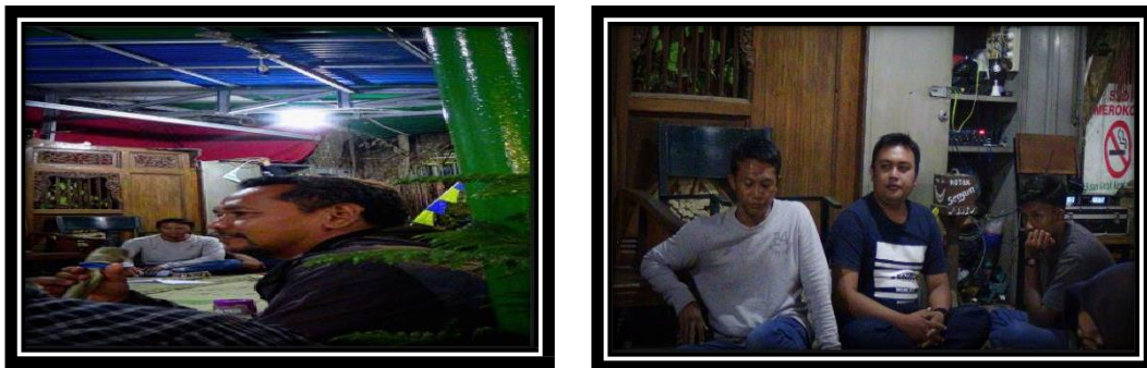
Figure 5. Sharing session by Karang Taruna at Kali Gajah Wong Tourism Village

The next step in assistance that is carried out is to carry out an evaluation as shown in Figure 5 below, where the youth organization as a financial manager wants an application regarding financial management reporting that can be accessed by all parties, for example the local community, so that it will be more transparent in its financial reporting. Because of this, the service team provided suggestions, one of which was to use the Google Doc application and share the results of their financial reports via WhatsApp group media.