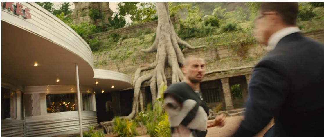
Figure 4. Eggsy encounters Charlie in the last battle.

Again in the scene (shown in Figure 4) of the encounter between Eggsy and Charlie, Eggsy wore a neat suit while Charlie wore a shirt and a casual pair of trousers typical of working-class people. Denotation: In terms of clothing, the different social classes are crystal clear. The background of the scene that displays the contrast between the well illuminated, clean modern Poppy's Dine building with the dirty neglected ruin of the old temple confirmed the irreconcilability of the different social classes. Connotation: the scene shows the different working conditions: Charlie looks like a mercenary who works only for money or personal benefit, while Eggsy maintains his composure as a gentleman secret agent who works for the benefit of millions of people. Myth: The differences between social classes are always existed and cannot be denied.