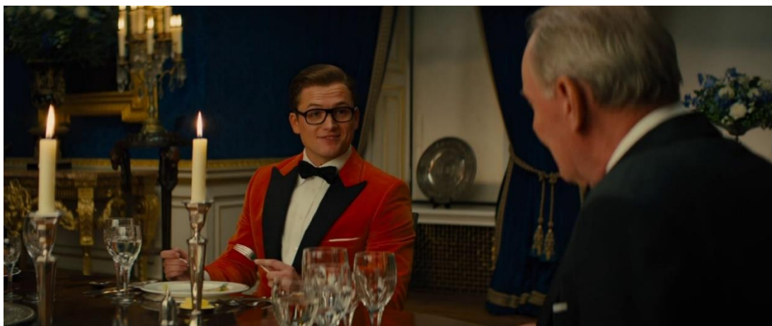
Figure 3. Eggsy encounters the Swedish king who will become his father-in-law at a royal family dinner.

Denotation: The two scenes in Figure 2 and Figure 3 show how different social classes enjoy different meals in different manners. Connotation: The two scenes contrast two different conditions. The working-class criminal dines with his boss without even wearing any shirt, while the gentleman secret agent dines with the Swedish king in a