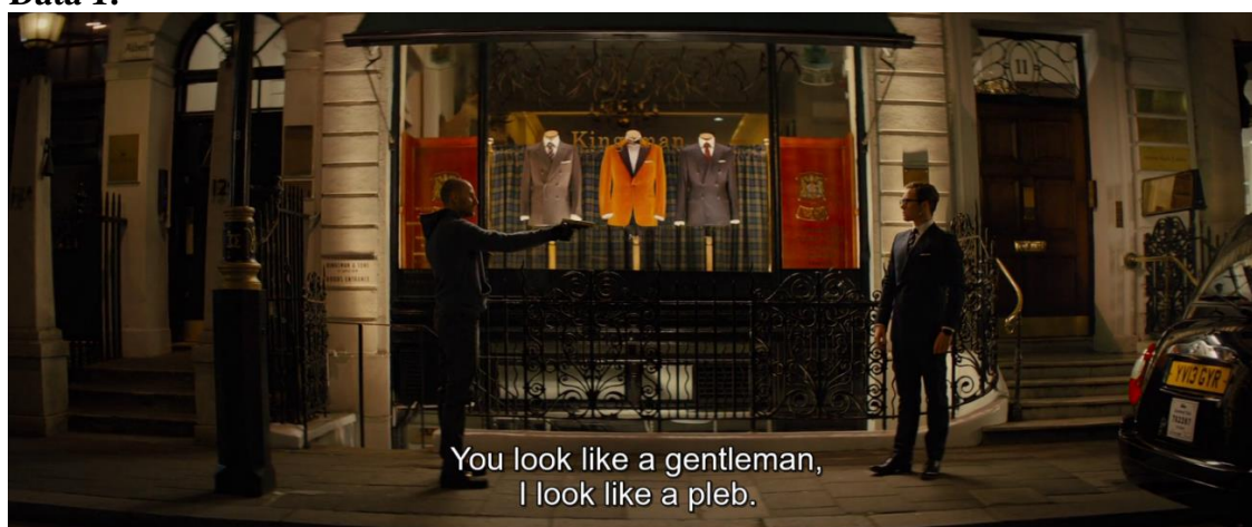
Figure 1. The first scene: the encounter of a well-suit Eggsy with Charlie who wears a hoodie.

Denotation: The scene depicted in Figure 1 shows how the working-class members and the upper-class member are in opposition or not at the same level in daily life. The scene before this one shows the opposition by displaying how Charlie came out from a rather dark street sidewalk while Eggsy came out from a well illuminated and ornamented building. This opposition is confirmed by the utterance of Charlie: “You look like a gentleman, I look like a pleb.”