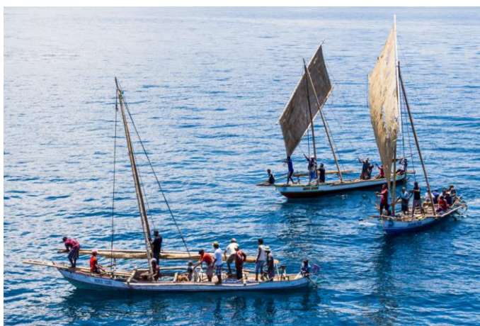
Figure 3. Pledang Lamalera in the Sawu Ocean

The making of the pledang begins with the ritual called pau laba ketilo , an event at the traditional house, atamola . All tribes are invited to participate in worship, prayer, and rituals to honor ancestors and offer sacrifices to the specific tools that will be used so that the pledang -making process can proceed smoothly and successfully.