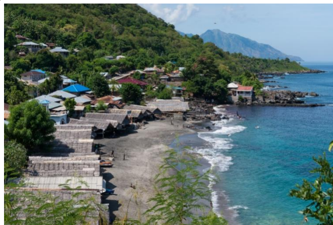
Figure 4. Naje: Boat House

Damaged and weathered boats find their place in naje . These boats are never discarded or sold as old or scrap items. The boats are highly sacred. The ancestral messages passed down through generations are strictly adhered to by the local community. Boats, especially peledang ( tena lamafaij ) used specifically for whale hunting ( koteklema ), cannot be sold under any circumstances. Lamalera boats cannot be brought in from outside the region or taken out of the area.