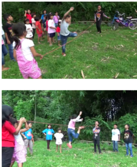
Figure 10. Children are playing yeye