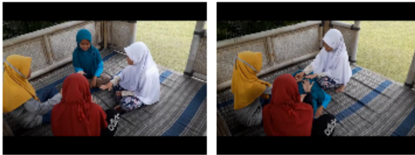
Figure 6. Children are playing cublak cublak suweng