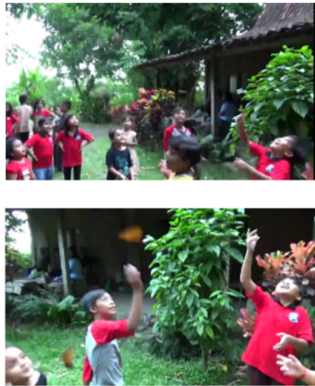
Figure 2. Children are tossing the pictures up in the air in the umbul gambar game

The player whose picture falls facedown must pay his defeat with a certain number of pictures as agreed in the beginning of the game, namely nggoro , nggopat , nggoluh and so on and so forth. The term nggoro means that the defeated player must pay with two pictures because the word ro refers to loro or two. In addition, nggopat means that the defeated player must pay four pictures because pat refers to papat or four. This game contains values of ‘loyalty’ to traditions (Lotter, 1994). The pictures being tossed upward are pictures of Shadow Puppet characters. It is important to instill the love of shadow puppet characters to children so they learn the values since early age (Yudiwinata & Handoyo, 2014).