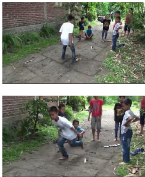
Figure 4. Children are playing sunda manda in the alleys of the village

The traditional children's game sunda manda can be played by both girls and boys. This game is played using chips of broken roof tiles or kereweng and a playing arena drawn in a specific pattern on the ground as in the hopscotch game. The player who gets the turn to play will take the chip and throw it on the square one by one, each time getting farther away gradually (Purwaningsih, 2006). Next, he / she must hop with one leg and stomp both feet when he/she enters the specific square. When the player arrives at the top square, he/she must hop back on one leg and retrieve the chip without stepping on the border line. To do this, he/she must maintain balance and precision when hopping (Masduki & Kumiasih, 2017; Rahmawati, Buchori, & Bhihikmah, 2017).