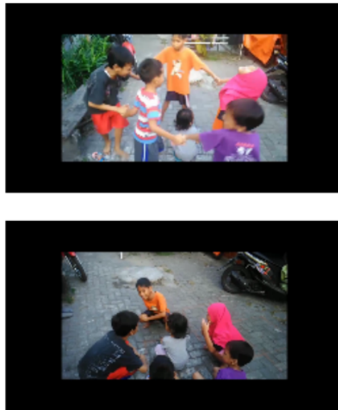
Figure 1. Children are playing jejamuran

In the Javanese society, there are various types of jamur 'mushroom'. Located in a tropical country, Java is highly humid which allows fungi to easily develop. With its ubiquity, mushrooms are familiar among people. Local values in the community are described by means of mushrooms to make them more acceptable among the community (Rakimahwati, & Putri, 2017). The jejamuran game symbolizes the value of solidarity that exists in the daily life of the Javanese community because only through solidarity they would be able to collaborate and work in mutual cooperation (Rakimahwati, & Putri, 2017; Suhono & Sari, 2017).