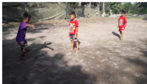
Figure 5. Children are playing gobak sodor