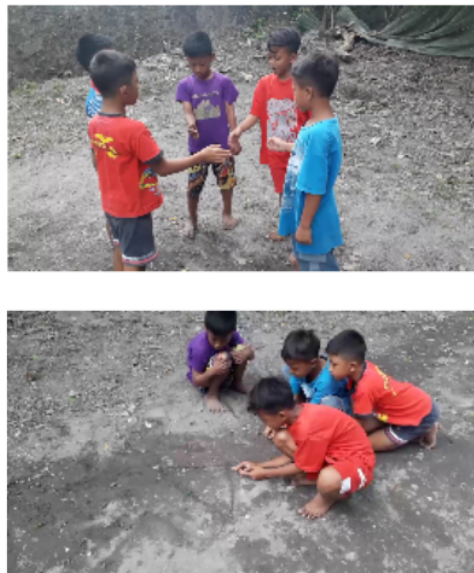
Figure 9. Children are playing nekeran

Nekeran or 'playing marbles' is one of the traditional children's games played by boys. This game used to be the favorite among Javanese boys. The game nekeran is played by at least two boys by means of marbles or neker . Marble is a round crystalized rock used for playing and it is available anywhere. The first player is the winner of the handgame pingsut or hompipa , a handgame to determine a winner as in 'paper, scissor, and rock' handgame. Afterwards, all the players toss the marbles simultaneously on the ground to approach the hole they have dug. The player whose marble falls closest to the hole or falls into the hole gets the first turn to play his neker . If the player can hit the target precisely to direct the other marble, he wins and he can take the other players' marbles (Kusumaningtyas & Setyoadi, 2017).