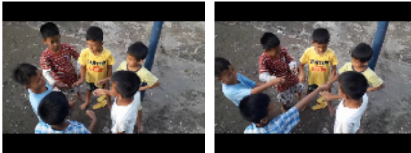
Figure 7. Children are discussing to play delikan